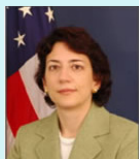
Polly Trottenberg , assistant secretary for Transportation Policy, U.S. DOT